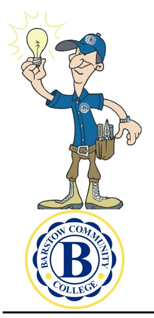
Barstow Community College